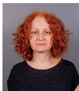
Rarița Zbranca Cultural Policies Lead